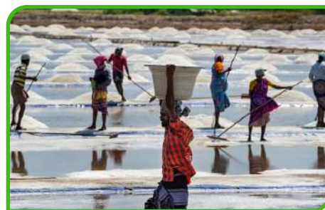
3rd Largest Producer of Salt in The World.