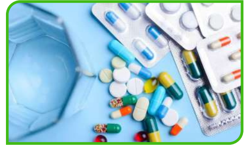
Pharma - Medical