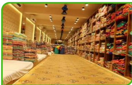
2nd Largest Textile Manufacturing Hub Surat.