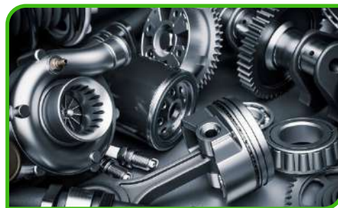
Auto parts - Pump