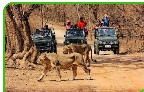
Only Sanctuary of Asiatic Lions in The World – Gir.