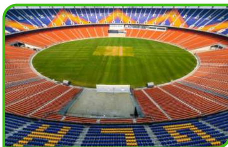
World's Biggest Cricket Stadium Narendra Modi Stadium, Ahmedabad.