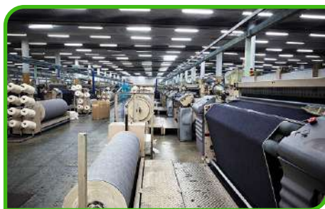
3rd Largest Producer of Denim in The World.