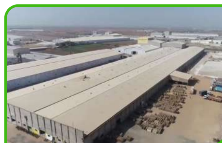
2nd Largest Ceramic Cluster in The World – Morbi.