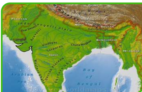
Longest Coastline of India 1600 Km.