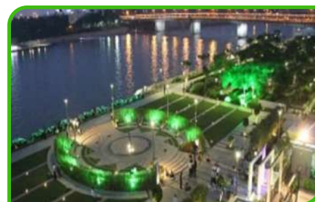
Sabarmati Riverfront, Infrastructural Marvel