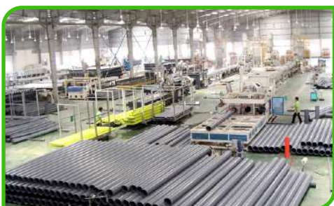
Plastic - Rubber