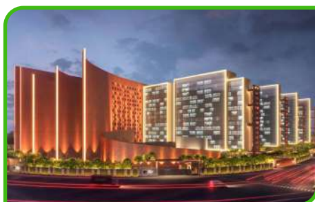
World's Largest Office Building Space Surat Diamond Bourse.