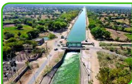
World's Largest Lined Irrigation Canal Narmada Canal.