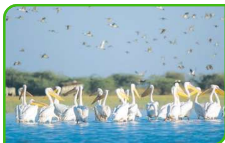
Largest Wetland Bird Sanctuary in The World – Nal Sarovar.