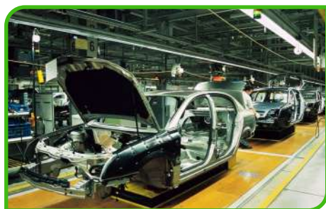
4th Largest Automobile Plant Sanand, Ahmedabad.