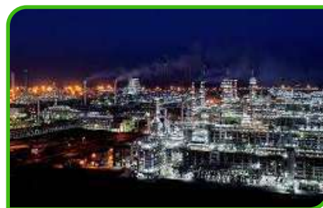
World's Biggest Refinery Complex Jamnagar.