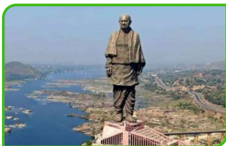
World's Tallest Statue : Statue of Unity.