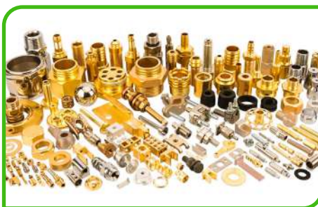
70% of India's Brass Products Manufacturing – Jamnagar.