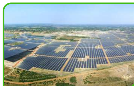
World's Largest Hybrid Renewable Energy Park, Khavda.