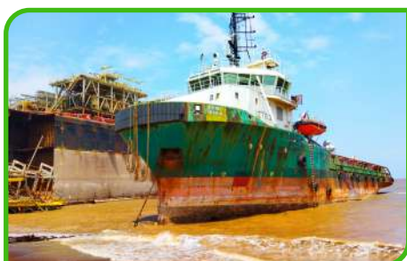
World's Largest Ship Breaking Yard Bhavnagar.