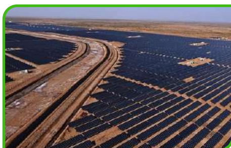
India's First Solar Park Charanka Village, Patan.